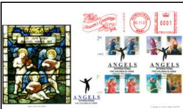
07/11/06 Christmas A Sheridan Angels International official cover with Season's Greetings meter mark (No.5 of only 26 produced) – price £35 inc. P/P