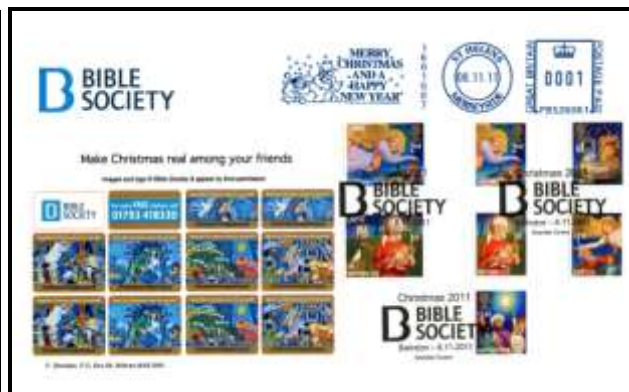
08/11/11 Christmas A Sheridan Bible Society official cover with Merry Christmas & Happy New Year (blue) meter mark (No.29 of only 30) – price £35 inc. P/P (Also available with Heartcry [Jesus Army] M/M)

Tel: 07939 832 184 E-mail: Sheridanfdcs@aol.com