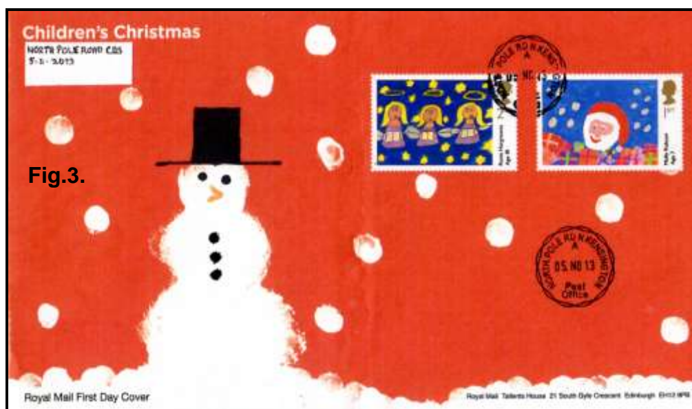
Fig.3 shows the stamps cancelled by North Pole Road, Kensington on 5.11.13, and Sam says only 3 covers were done

Fig.2 shows the stamps cancelled with Aberdeen, St. Nicholas C.D.S. on 5.11.13, and Sam says only 4 covers were done