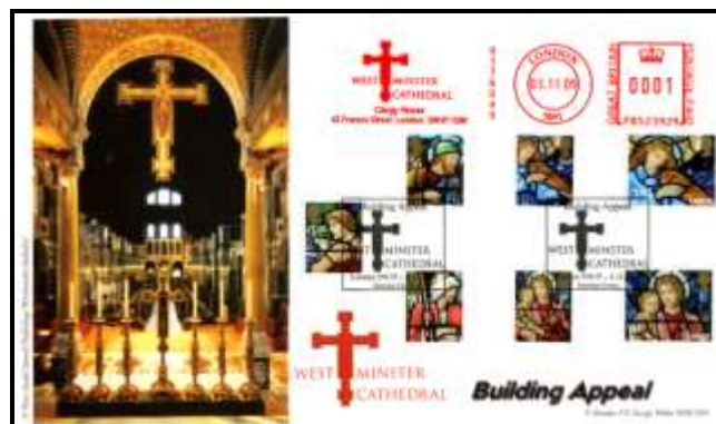
03/11/09 Christmas A Sheridan Westminster Cathedral official cover with Westminster Cathedral meter mark (No.33 of only 35 produced) – price £35 inc. P/P