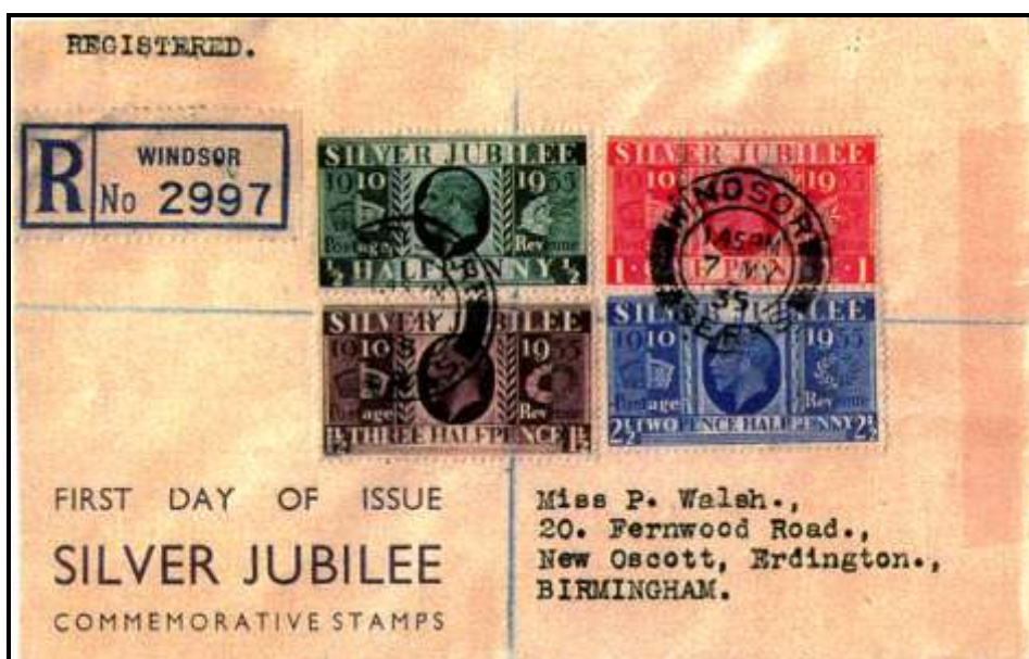
Windsor, Berks. cancelled cover