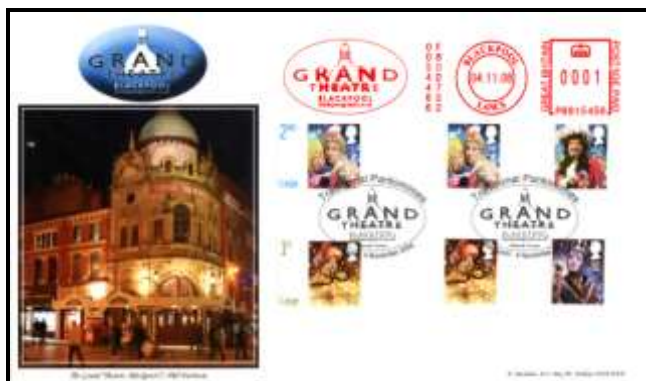
04/11/08 Christmas A Sheridan The Grand Theatre, Blackpool official cover with The Grand Theatre, Blackpool meter mark (No.26 of only 34) Extra scarce to get hold of hence – price £45 inc. P/P