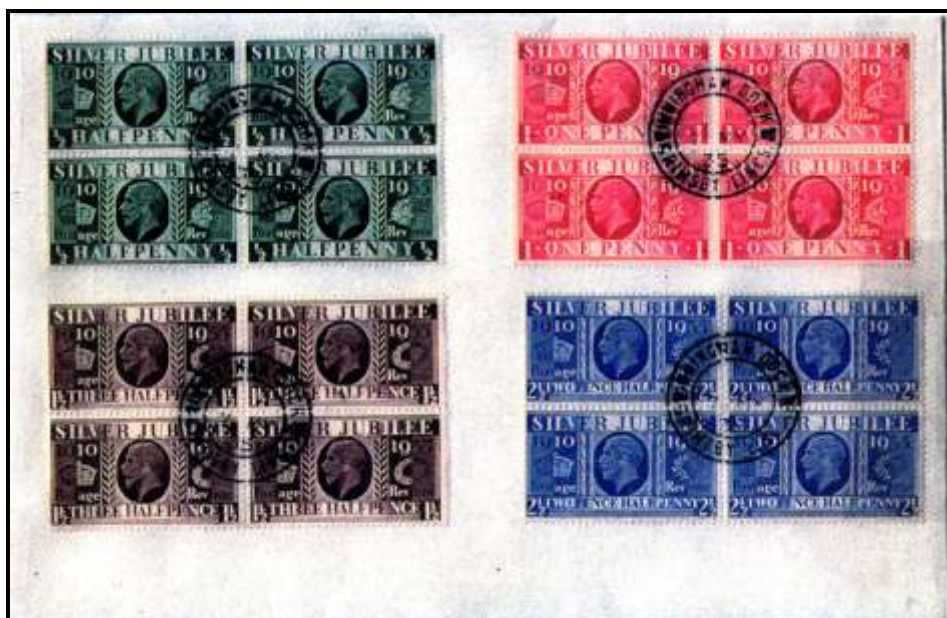
Immingham Dock, Grimsby, Lincs. cancelled cover