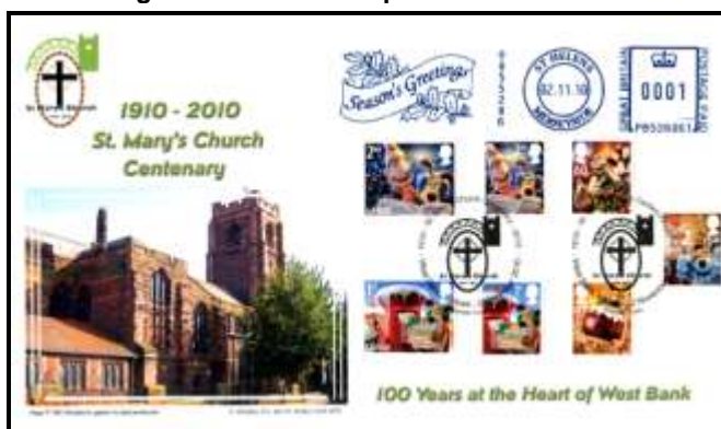
02/11/10 Christmas A Sheridan St. Mary's Church Centenary official cover with Season's Greetings (blue) M/M (No.2 of only 29) – price £35 inc. P/P (Also available with Heartcry [Jesus Army] M/M)