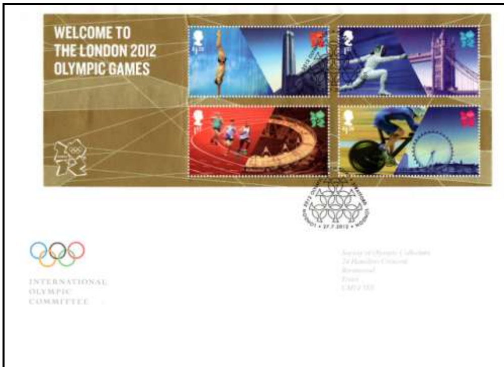
Figure 1 , Full miniature sheet with London 2012 Olympic Torch Relay, Stratford, London, of which ONLY 10 WERE PRODUCED

Further to the letter and cards sent in by Ian Balcombe ( First Day Coverage , August 2014, page 6), I would like to point out that there were two actual OFFICIAL covers besides the two cards shown by Ian Balcombe. The two covers shown below were produced by the Society of Olympic Collectors which was displayed in the British Library where I went on the day. I had a discussion with the people on the stand and explained I had come for the covers only to discovery that approximately 100 of the OFFICIAL unstamped covers had been stolen, so I was totally disappointed. Anyway after a time, and consistent badgering of the Society of Olympic Collectors for at least one of the covers, I managed to get TWO with different postmarks.