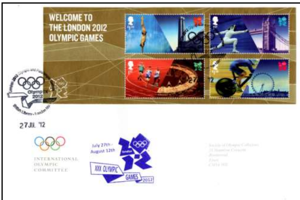
Figure 2 , Full miniature sheet with London 2012 Olympic and Paralympic Games, British Library, London NW1, with a cachet at the bottom of the cover, of which ONLY 7 WERE PRODUCED