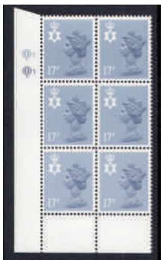
1986 Northern Ireland 17p Type II Questa cylinder blocks of 6 £377.60 & £342.20