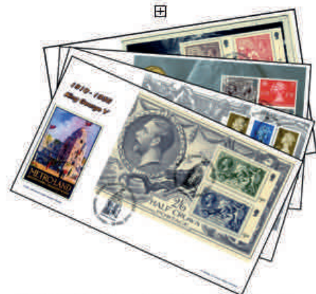
08.05.10 King George V PSB Panes on 4 Sheridan British Empire Exhibition official covers - £58 (32 sets done, Last set)