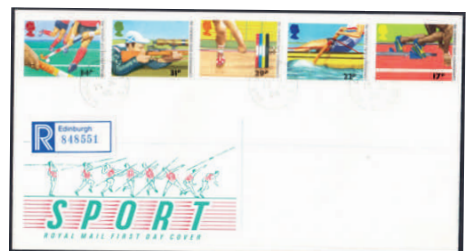
1986 Commonwealth Games Royal Mail FDC with Mobile Post Office 2 CDS (used in the Games Village)