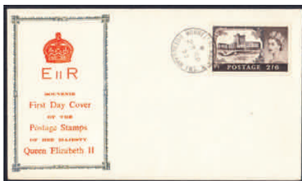
1955 2/6d Waterlow Castles on unaddressed illustrated First Day Cover