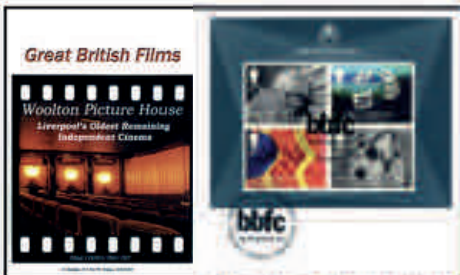
19.05.14 Gt. British Films M/S on Sheridan Woolton Picture House official cover. No. 14 of only 20 done - just one left - £55