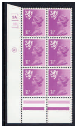
Scotland 31p Type II Waddington cylinder block of 6 £472

These postal auctions are held monthly. There is no Buyer's Premium.