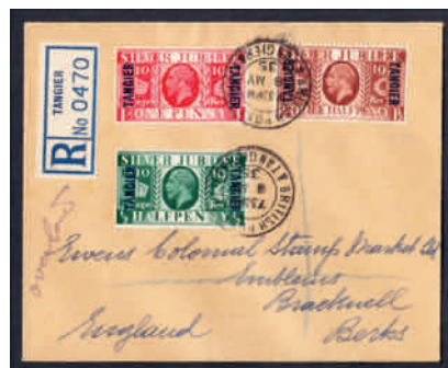
1935 Silver Jubilee matching registered set of 4 Morocco Agencies & Tangier £413