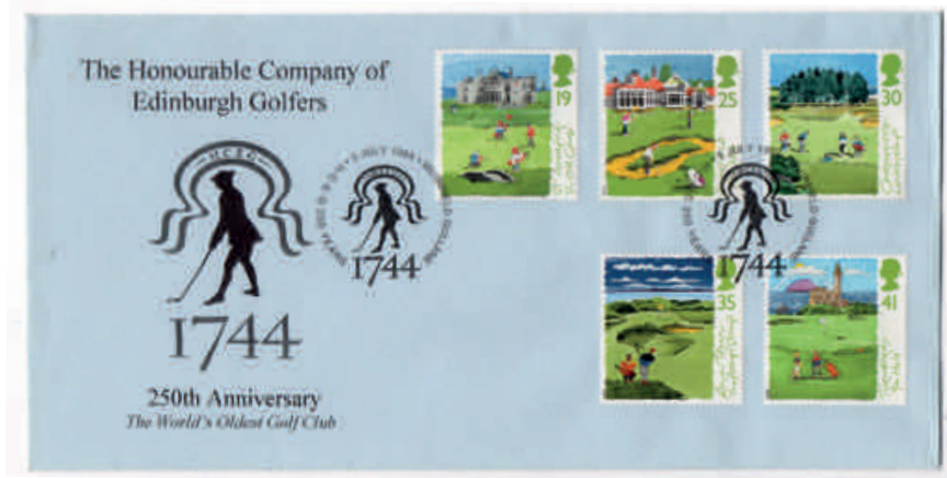
1994 Golf HECG Official (possibly looks official) with a FULL SET. This is 1 of 8 covers which I bought at the Stafford Stamp Fair some time ago.