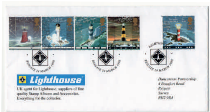
1998 Lighthouses Lighthouse Reigate with FULL SET on Lighthouse Publications Official. This was bought off a reputable dealer.