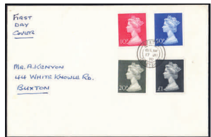
1970 High Values set including the £1 value on a plain handwritten First Day Cover