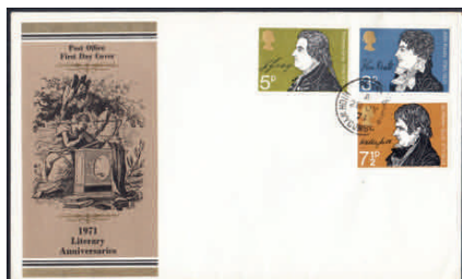
1971 Literary Anniversaries Post Office FDC with Penn CDS