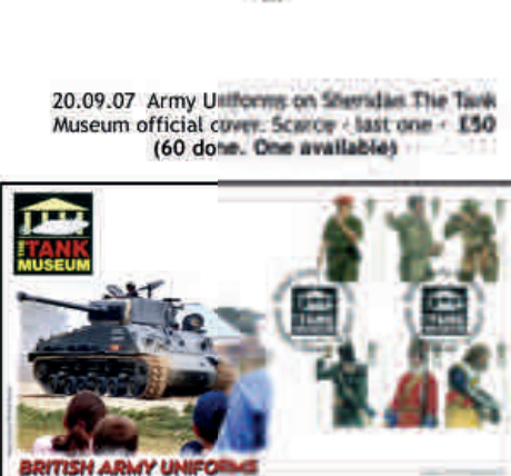
20.09.07 Army Uniforms on Sheridan The Tank Museum official cover. Scarce - last one - £50 (60 done, One available)

Tel: 0151 510 1409 or 07975 858 815 E-mail: Sheridanfcds@aol.com If we are not available then please leave your message. We will get back to you.