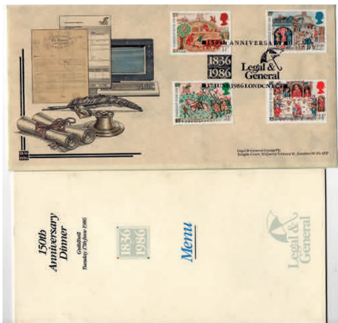
Medieval Life Legal and General Covercraft Official with FULL SET and also the Menu card that was used at the 150th Anniversary Dinner. I was fortunate to get this on ebay which was in a frame and the menu was on the back of the frame.