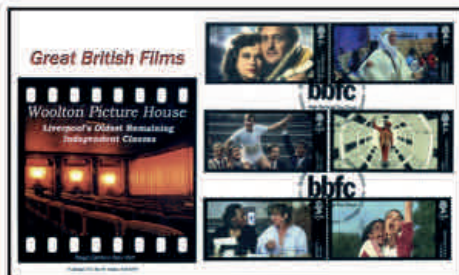
19.05.14 Gt. British Films set on Sheridan Woolton Picture House official cover. No. 14 of only 20 done - just one left - £55

The covers below are all scarce and rare official covers. All my low run and double covers increase in value very quickly. All prices include postage. For this newsletter ONLY - 20% Discount applies on any order. Get your scarce & rare Sheridan Cover while you can.