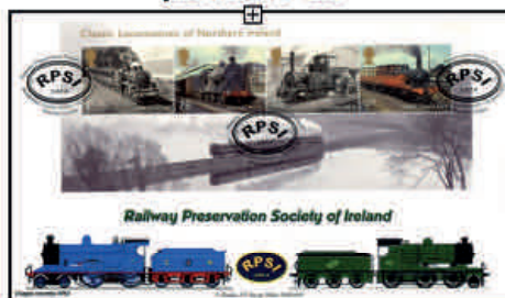
18.06.13 Locomotives of N.I. M/S on Sheridan Railway Preservation Society of Ireland official cover produced for private collection - £55 (24 done) One Available