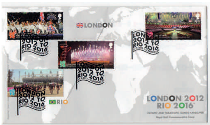
2012 London 2012 to Rio 2016 Olympic and Paralympic Games Handover Royal Mail Commemorative cover with FULL SET. I have seen one on ebay at over £500