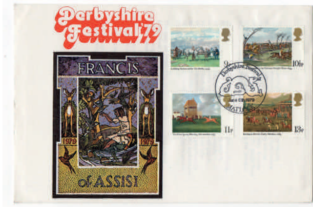
Horse Racing Derbyshire Festival 79 Official cover with FULL SET This was again won on ebay for a decent price a few years ago