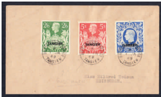
1948 Tangier High Values set of 3 £342.20