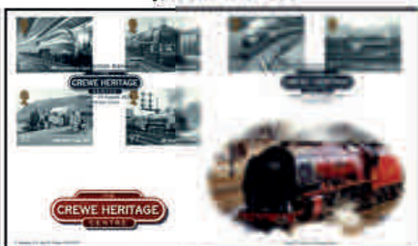
19.08.10 Gt. British Railways on Sheridan Crewe Heritage